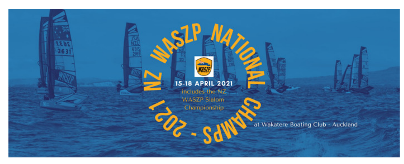
2021 NZ Waszp National Championship 15-18 April 2021

Wakatere Boating Club once again had the opportunity to host a major national event as a Sailors for the Sea Clean Regatta - while the entry list was relatively small as we continue to see the effects from Covid - the same messaging and the same effort was put in to looking after our marine environment.