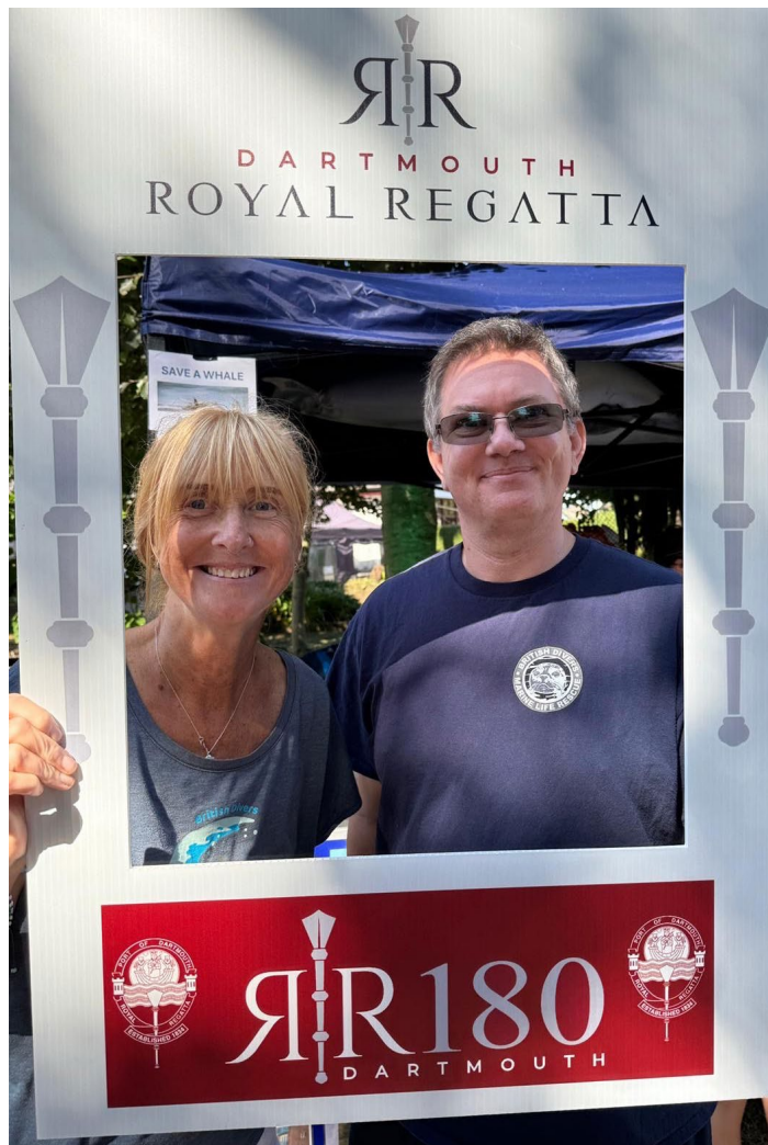
- British Divers Marine Life Rescue