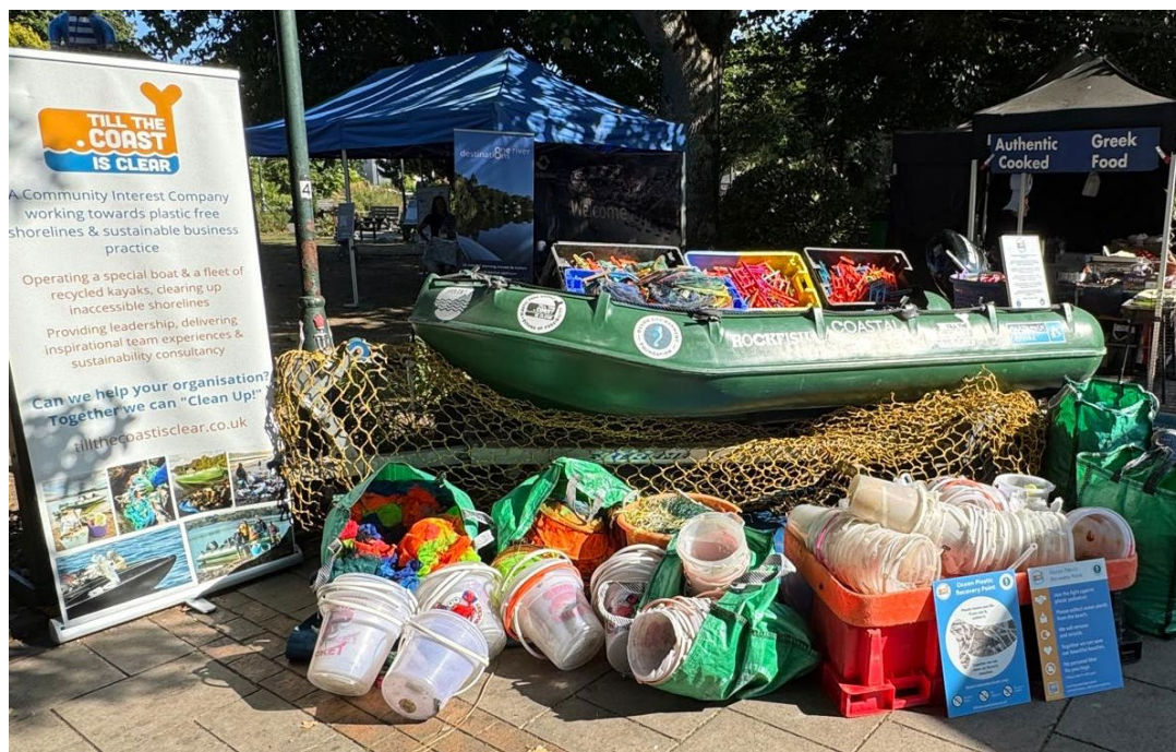
- Till the Coast is Clear