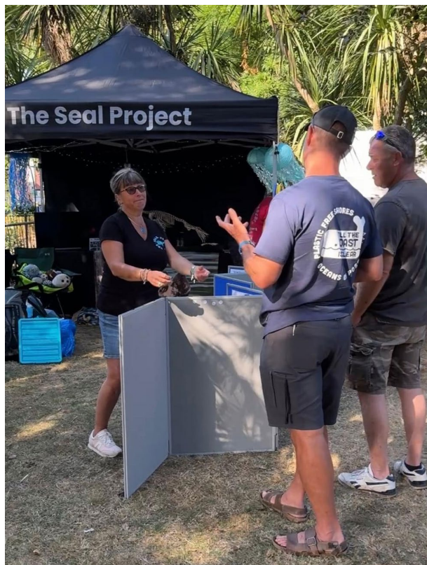
- The Seal Project

For our 180 th Royal Regatta in 2025 we hosted an Environmental Day in the Royal Avenue Gardens, Dartmouth. A day was set aside to showcase the many partners who we have worked closely with over the past few years. All partners were offered stall spaces and time on the main stage to explain and expand on their aims. The day was well covered on social media and partners and attendees were: