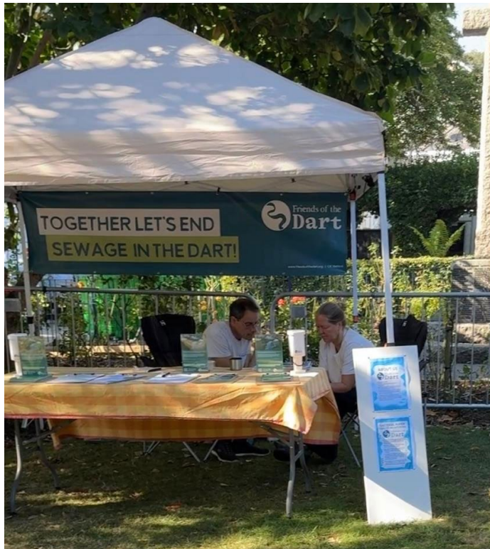
- Friends of the Dart

On Fri 29 Aug we were fortunate to be visited by the Deputy Lord Lieutenant as His Majesty The King's representative in Devon. She undertook a detailed visit encompassing sports, local businesses and meeting Committee and Green Team members. Throughout the visit she was hosted by both the Chairman and the Harbour Master and conveyed aboard Phoebe their electric Yacht Taxi of which we have reported previously.