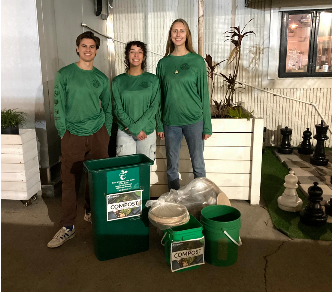
Composting bins placed throughout dining hall

The Islander Green Team provided compost bins and volunteers to supervise them during the Skipper's Meeting dinner at Nueces Brewing Co. and one evening at the Farmer's Market where sailors dined on meals prepared by food trucks. All compostable items collected were hauled to the "Garden of Grace" for inclusion in the their Compost Program.