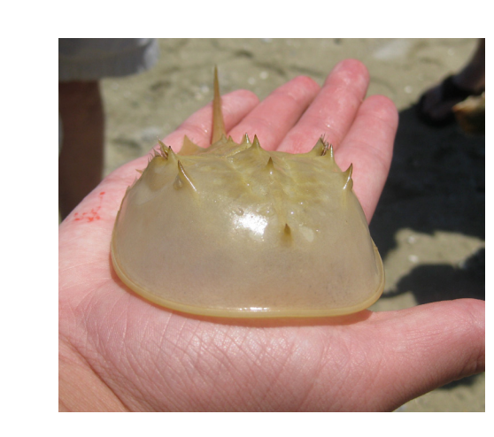
HORSESHOE CRAB MOLT