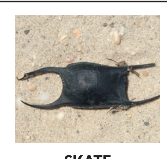
SKATE EGG CASE