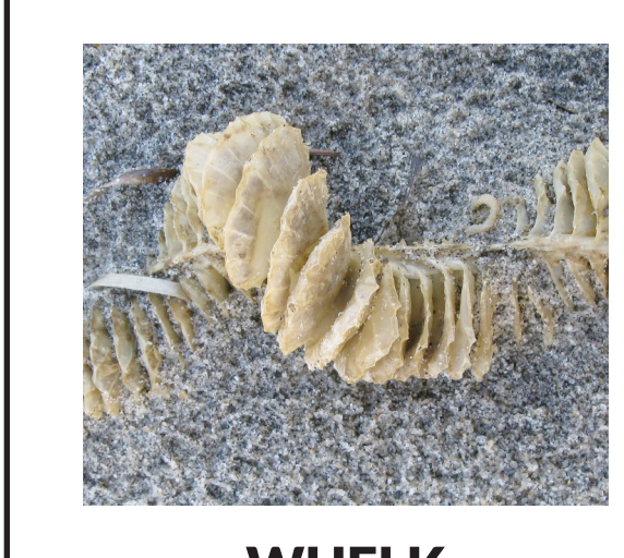
WHELK EGG CASE