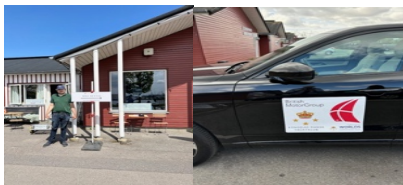
Bike rental "Car-sharing"

In addition, a bike rental is established at the regatta office, in agreement with the local bike rental shop, with all needed bikes being supplied to the harbor and thereby only storing and transporting the needed rental-bikes.