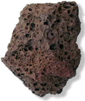
Scoria An Igneous Rock