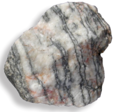
Gneiss A Metamorphic Rock

Melting, cooling and hardening Turns you into an Igneous Rock! Erosion, deposition and cementation Turns you into a Sedimentary Rock! Transformation by heat and pressure Turns you into a Metamorphic Rock!