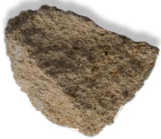
Limestone A Sedimentary Rock