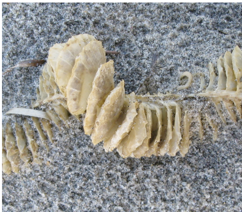
WHELK EGG CASE