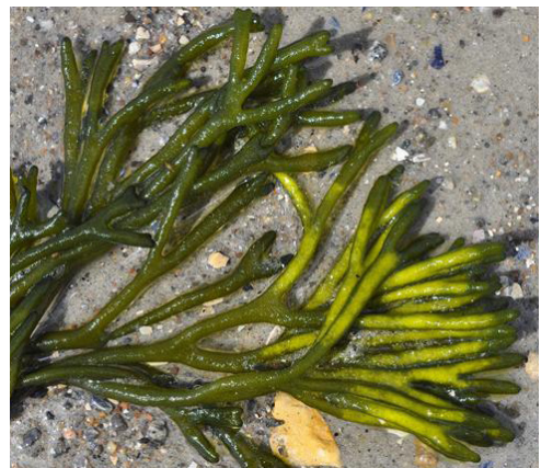
DEAD MAN'S FINGERS