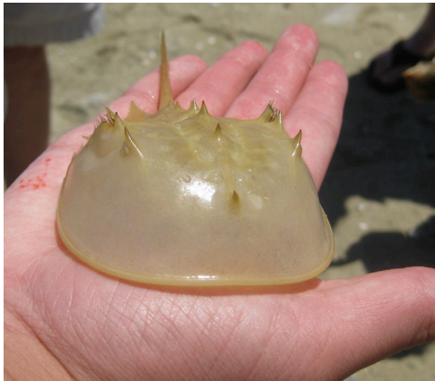
HORSESHOE CRAB MOLT