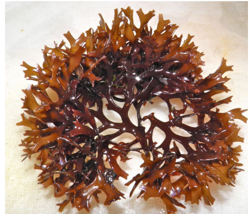
IRISH MOSS SEAWEED