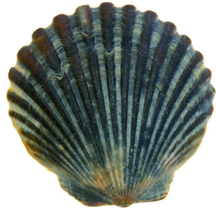
BAY SCALLOP SHELL