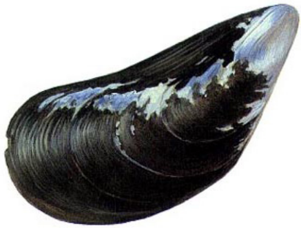
BLUE MUSSEL SHELL