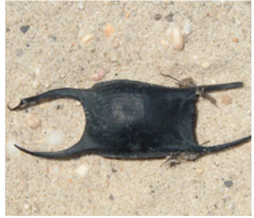
SKATE EGG CASE