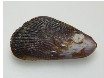
RIBBED MUSSEL SHELL